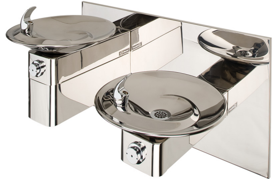
Shown mounted on 1011HPS

To see all options for this model, visit www.hawSCO.com