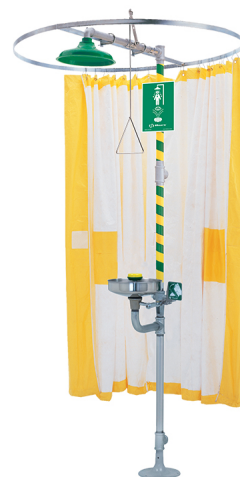
Shown Installed on 8300-8309

To see all options for this model, visit www.hawesco.com